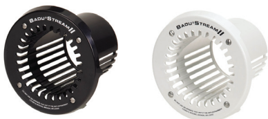
Optional round covers available in the colors black, gray, and white.

Consult your physician before attempting any strenuous exercise. This product may not be challenging or satisfying for all levels of exercise.